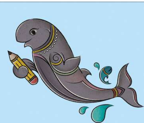
IRA the DOLPHIN - Our School Mascot